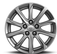
18" 10-spoke aluminum wheels with Bright Silver finish