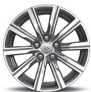
18" 10-spoke aluminum wheels with Diamond Cut/Argent Metallic finish