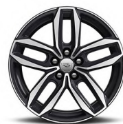
20" Twin 5-spoke aluminum wheels with Diamond Cut/Titan Satin finish