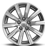
18" 10-spoke aluminum wheels with Pearl Nickel finish