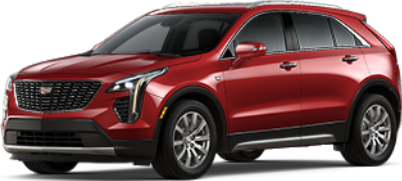
Infrared Red Tintcoat (GSK) 9