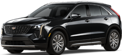
Stellar Black Metallic (GB8)