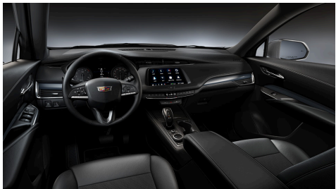
Jet Black cloth and leatherette seating surfaces with Jet Black dashboard accents and aluminum metallized trim (H1T)