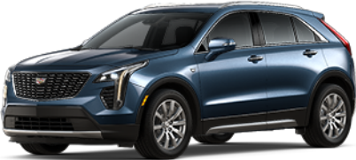
Twilight Blue Metallic (GA0)