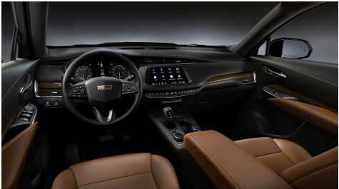
Sedona leather and leatherette seating surfaces with perforated inserts, Jet Black dashboard accents and Finline Calico high-gloss wood trim (HRX) 10 11