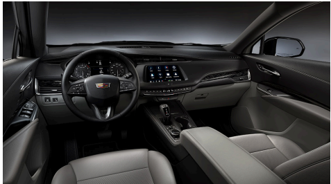
Light Platinum leather and leatherette seating surfaces with perforated inserts, Jet Black dashboard accents and Linear Galaxy high-gloss wood trim (HRL) 10