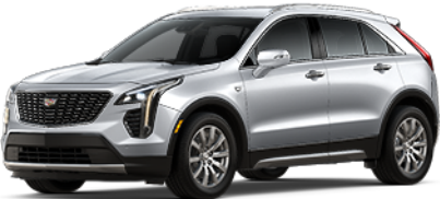
Radiant Silver Metallic (GAN)