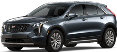
Shadow Gray Metallic (GJI)