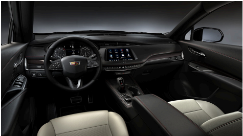
Light Wheat leather and leatherette seating surfaces with perforated inserts, Jet Black dashboard accents, Red stitching and Morello Red high-gloss carbon-fiber trim (HRP) 10