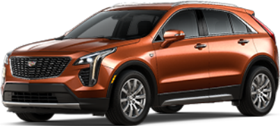
Autumn Orange Metallic (GM6)